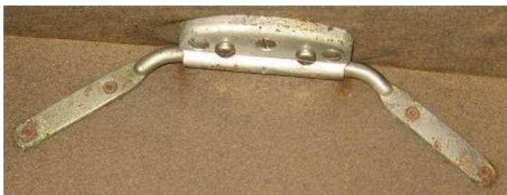
Late 1931 heavy duty sun visor hinge. Victoria and slant window 4 door sedans. (Used interchangeably with standard hinge.)