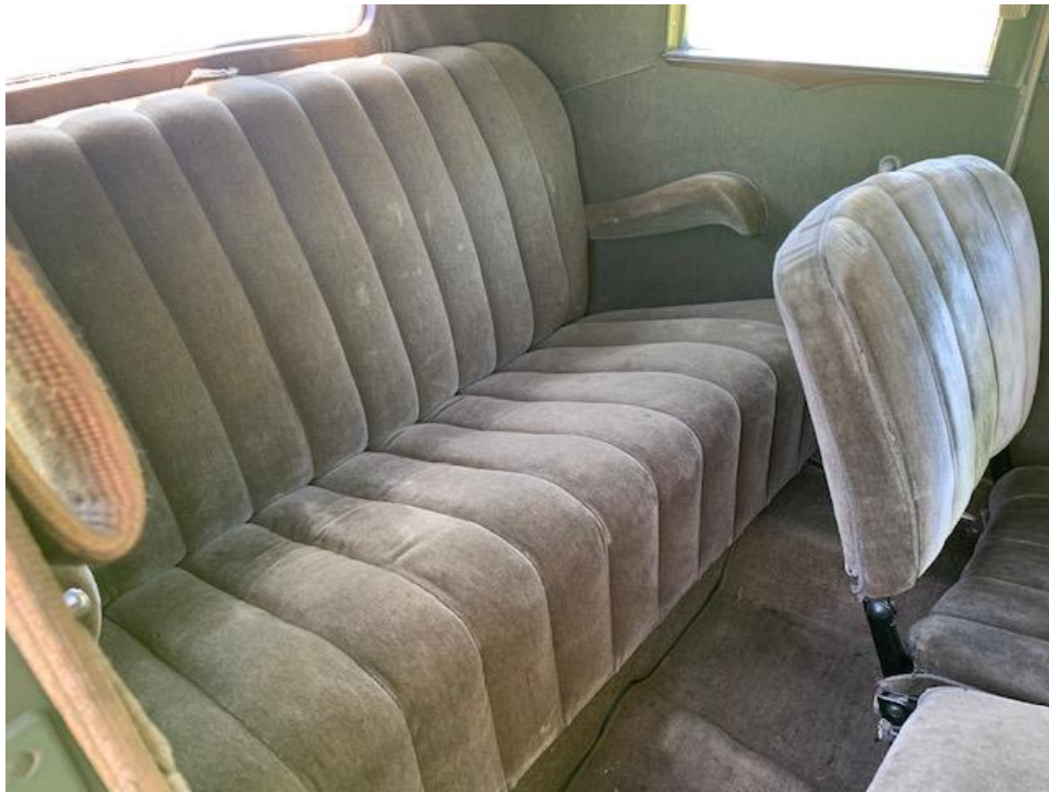
April 1931 - Leather back Victoria original Mohair interior

Wife: In the swimming pool. Husband: Its flooded.