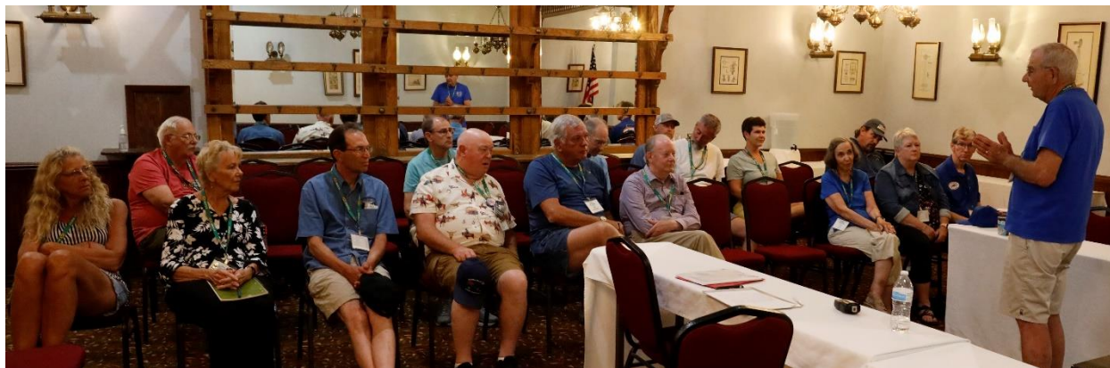
Victoria Association gathering in Kerrville, TX

I had been getting ready to attend the MAFCA National Meet in Ruidoso and I planned to put off writing my President's message until I returned. It is amazing how fast the best laid plans can change. Due to 2 forest fires around Ruidoso, the Meet was canceled, and Ruidoso was evacuated. Monday (6/17) I was packing for the trip, and Wednesday evening I was unpacking. I was really looking forward to the Victoria Association gathering and meeting some of the VA members. The Victoria Association had a very good gathering two years ago in Kerrville, TX